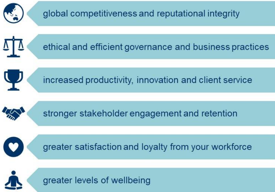
Figure 1: Economic benefits of diversity and inclusion

A strong commitment to diversity and inclusion is good for your organisation's balance sheet. Studies 1 show that organisations with diversity and inclusion strategies and cultures create a range of benefits outlined in Figure 1.