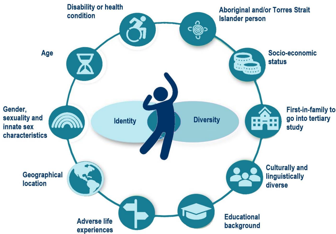
Figure 3: Dimensions of diversity and identity