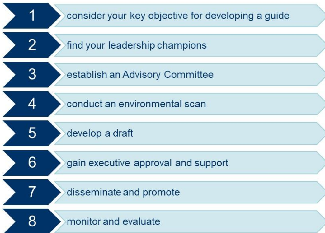
Figure 2: Steps for developing an inclusive communication guide

We recommend the following eight (8) steps 3 to developing or redeveloping your inclusive communication guide.